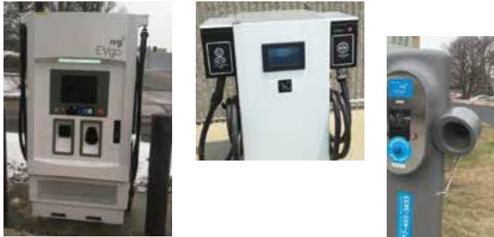
Examples of charging stations

Shut off the charging station by pressing the large red or blue “ emergency stop” button.