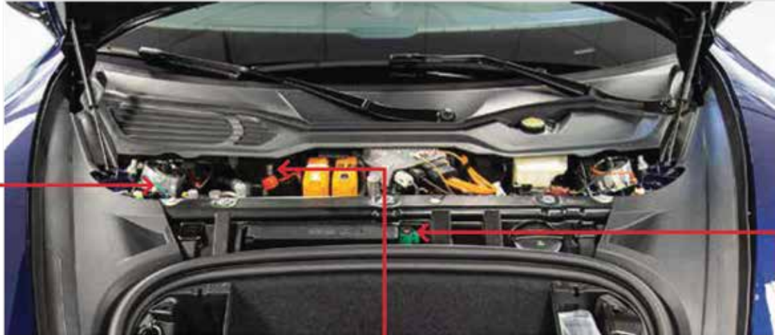
Negative 12-volt jump post