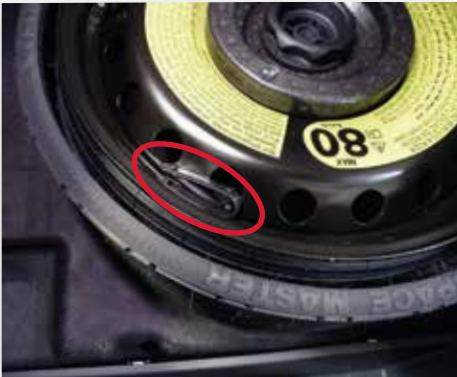
With Spare Tire

The Lug Nut removal tool can be found in a few different locations in the vehicle