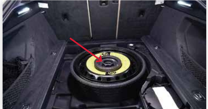
Remove plastic hold down nut on Collapsible Spare Tire