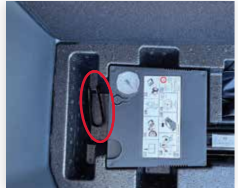
Next to Air Compressor

During inflation Collapsible Spares may appear to deploy in an unconventional manner. The following characteristics are normal: