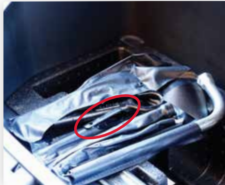
In Tool Kit Bag