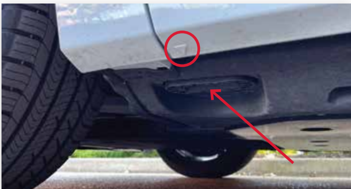
Front Jack Lifting Point