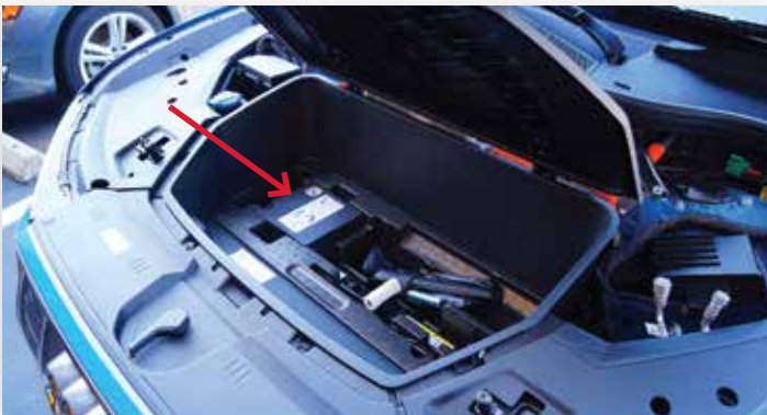
The Tool Kit and Air Compressor can be found under the cargo floor of the front storage compartment, under "Hood". Remove load floor