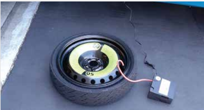
Spare Tire MUST be inflated laying on its back, prior to installing to vehicle. See Tire Pressure Decal inside Driver's Door for recommended pressure. Inflation time 6-8 minutes.