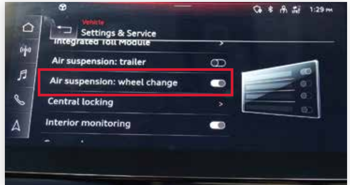
Toggle "Air Suspension: Wheel Change" as shown