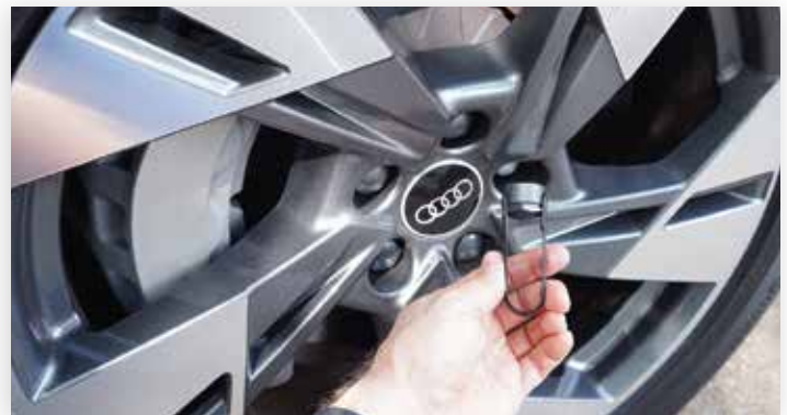
Remove Lug Nut Covers