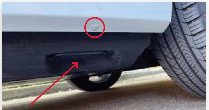
Rear Jack Lifting Point

After changing tire and lowering jack, toggle "Air Suspension: Wheel Change" off in the "SETTINGS & SERVICE" menu