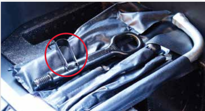
Lug Nut Cover removal tool will be needed to remove decorative covers on lug nuts.