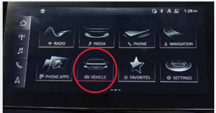
Prior to Jacking Vehicle for Tire Change the Air Suspension should be disabled. In vehicle's Infotainment display Select "VEHICLE"