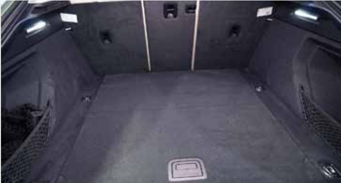
Remove load floor in rear cargo area

Place vehicle in Park, Set Parking Brake, & Chock Tires before proceeding