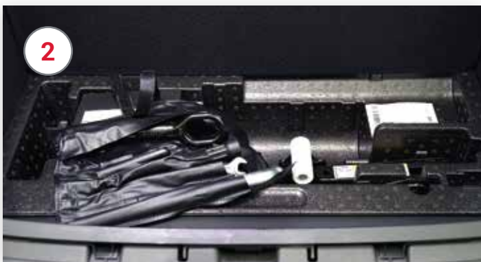
Tow Eyelet is in the Tool Kit