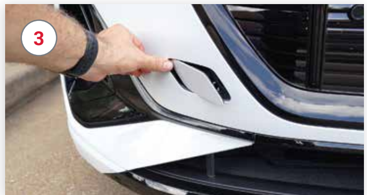
Press on top left corner to remove Front Tow Eyelet Cover