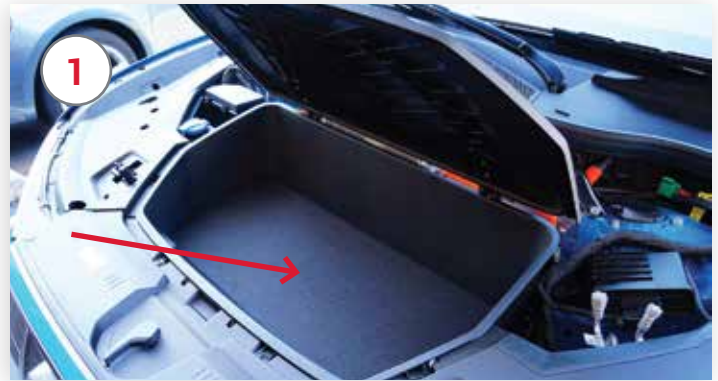
The Tool Kit can be found under the cargo floor of the front storage compartment, under "Hood"

Prior to activating "Free-Roll" make all connections to Tow Vehicle to prevent roll away.