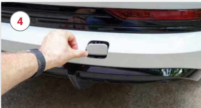
Press at bottom to remove Rear Tow Eyelet Cover

If vehicle is equipped with factory trailer hitch Tow Eyelet provision in rear bumper is not available