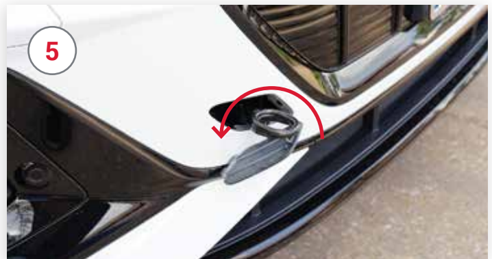
Tow Eyelet has Left Hand thread cut. Screw in Tow Eyelet to shoulder until it's seated in bumper beam

If vehicle is equipped with factory trailer hitch Tow Eyelet provision in rear bumper is not available