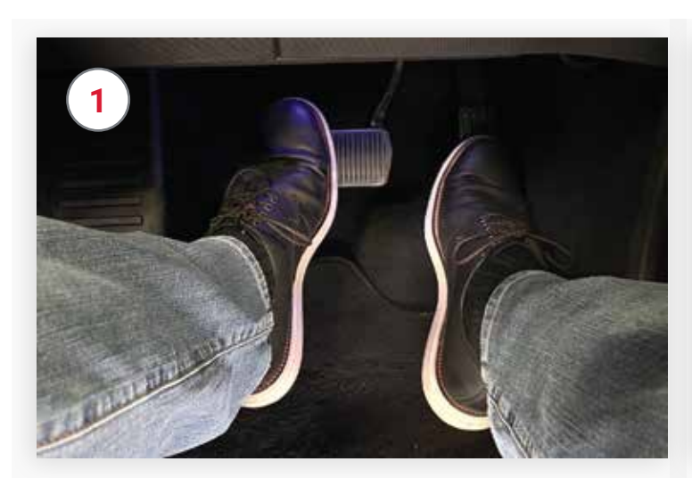
Press the accelerator AND brake all the way down.

Start the process by pressing the push-button-start (foot NOT on brake) to enter accessory mode.