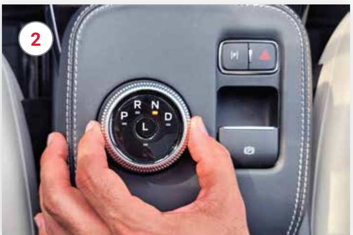
Shift the vehicle from P (Park) to N (Neutral) while holding both pedals all the way down.