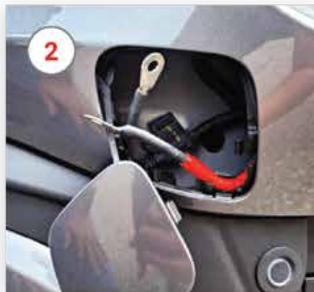
2 Make connections at remote terminals to energize vehicle for entry & open driver door.