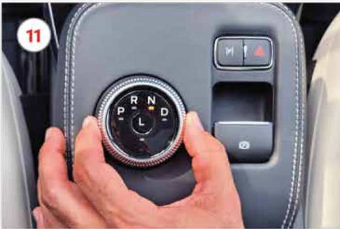
Shift vehicle to "N" Neutral with rotary shifter in center console

Prior to activating "Neutral Mode" make all connections to tow truck to prevent roll away.