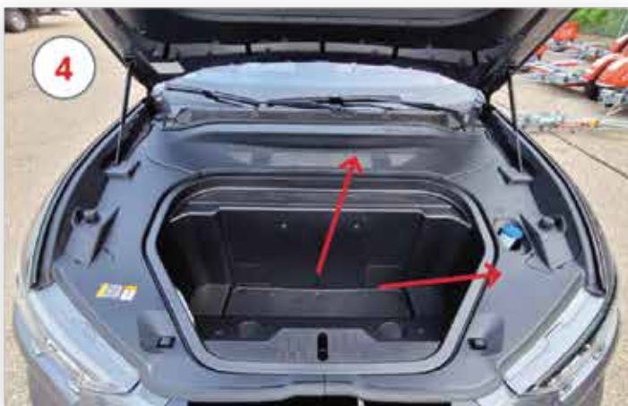
4 Cowl & driver side trim panels will need to be removed. No tools are required.

Start with cowl panel along rear edge, passenger side.