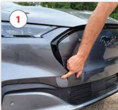
1 Remove panel in front bumper pressing at top to remove from bumper cover.

If the vehicle's 12-volt system is active (charged) and grants access through the driver's door, proceed to Step 9 – Towing and Neutral Mode .