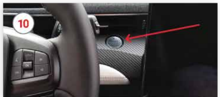
With Key Fob present press " Start " button to power up vehicle