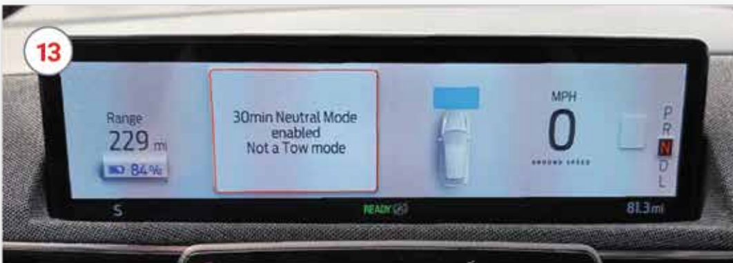
Vehicle will enter "Neutral Mode" for 30 minutes as indicated in dash information display