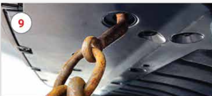
Make connections to the disabled Mustang Mach-E at the round openings under front bumper

Prior to activating "Neutral Mode" make all connections to tow truck to prevent roll away.