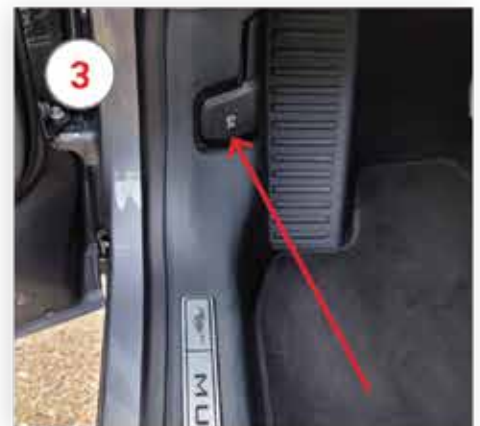
3 Pull front luggage compartment release twice to fully release front cover for opening.