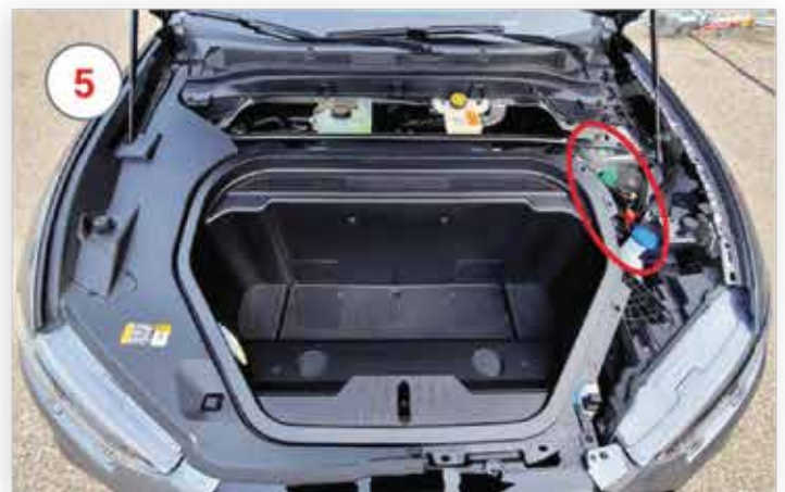
5 Remote jump post locations

See images 7 & 8 for clip locations to ease in removal.