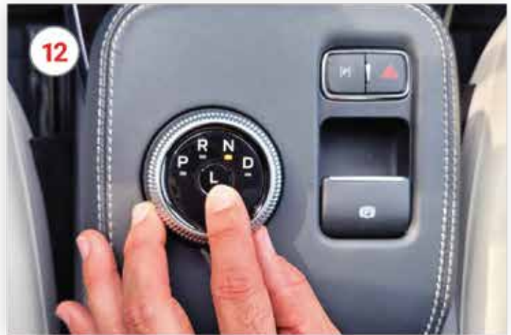
Press "L" in center of rotary shifter