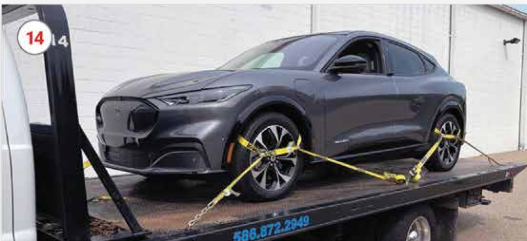
Load vehicle to Rollback Tow Truck for transport, 8 Point Retention ONLY

To turn off "Neutral Mode" place vehicle back to Park Select Park and set Park Brake during Transport