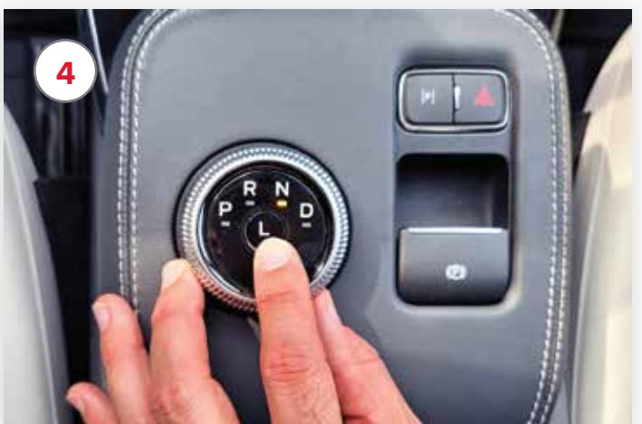
Press 'L' in center of rotary shifter