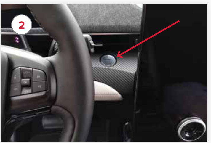
With Key Fob present press ' Start' button to power up vehicle