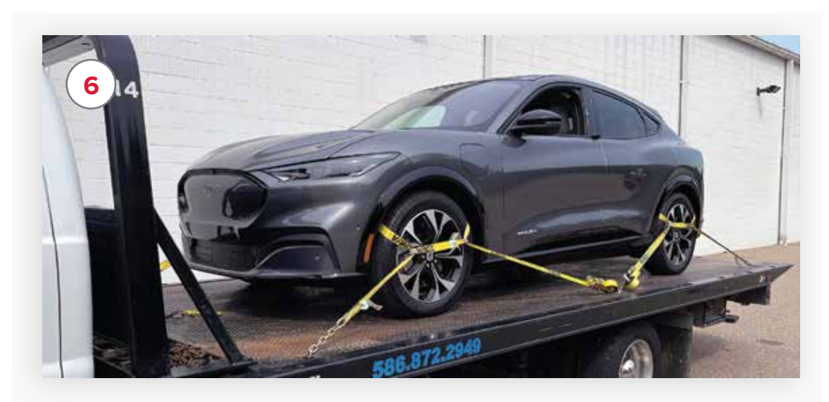
Load vehicle to Rollback Tow Truck for transport, 8 Point Retention ONLY

To turn off 'Neutral Mode' place vehicle back to Park Select Park and set Park Brake during Transport