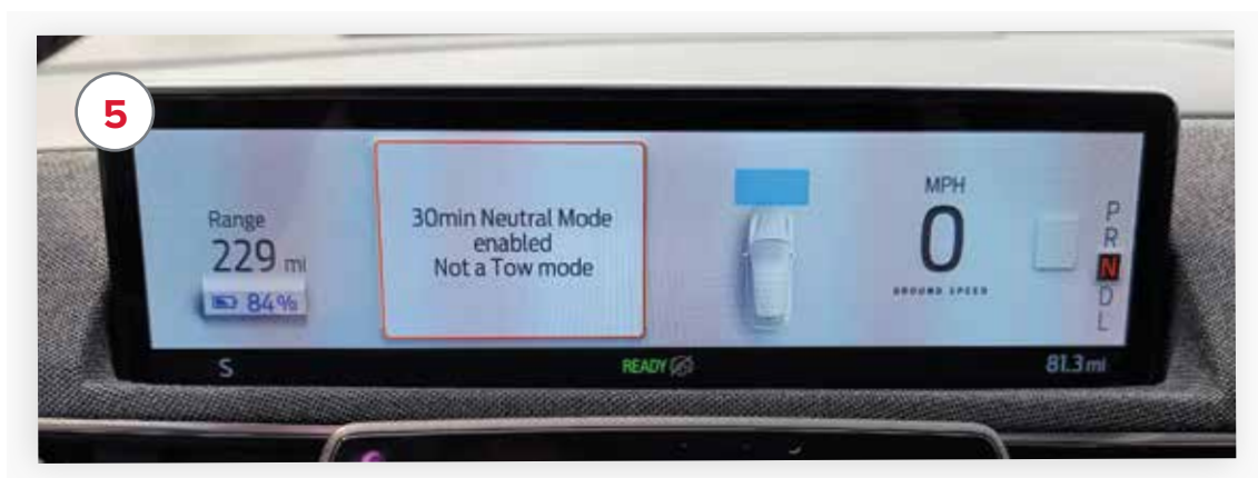
Vehicle will enter 'Neutral Mode' for 30 minutes as indicated in dash information display

Prior to activating "Neutral Mode" make all connections to tow truck to prevent roll away.