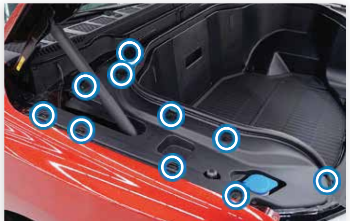
Disengage all 1/4 turn fasteners, turn counterclockwise, remove panel lifting from the rear first.