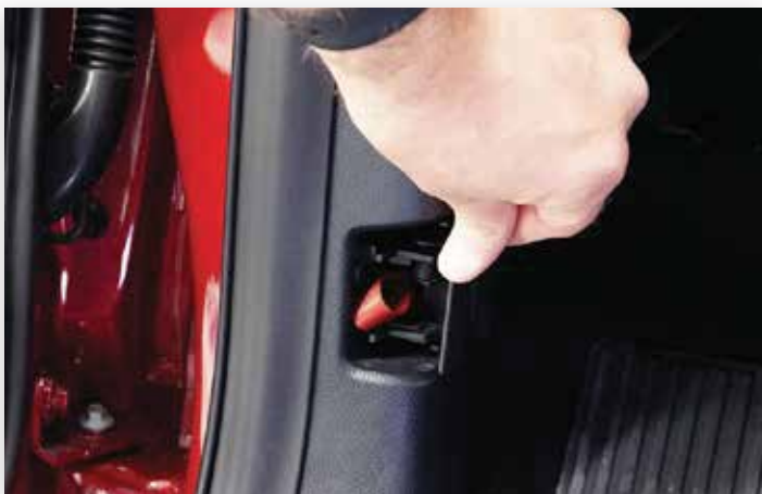
In Driver Side kick panel, pull red tether to open front trunk.