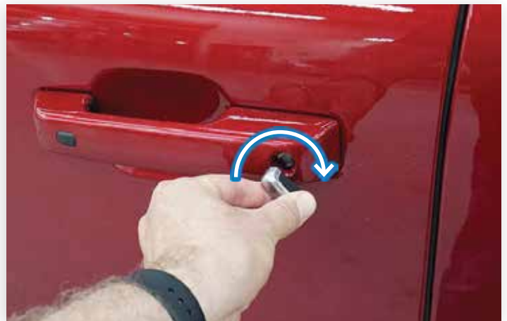
Insert Key Blade in Lock Cylinder. Rotate Clockwise, pull handle to open.