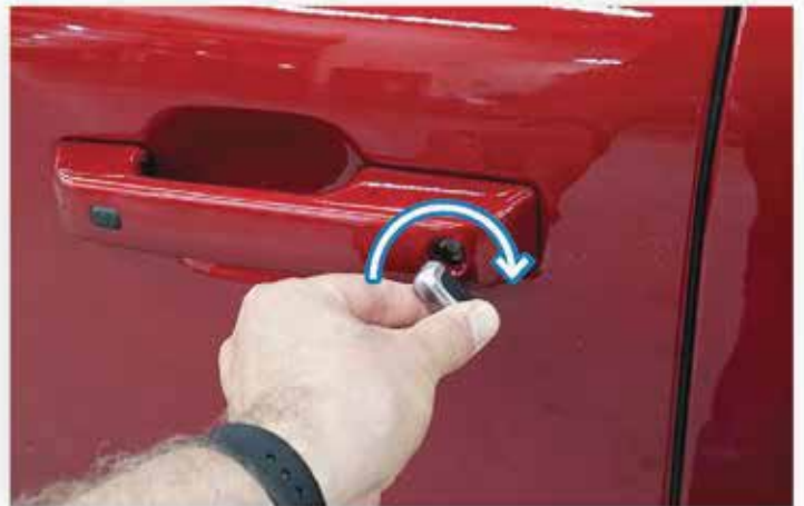
Insert Key Blade in Lock Cylinder. Rotate Clockwise, pull handle to open.