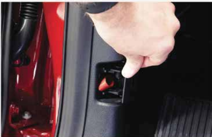
In Driver Side kick panel, pull red tether to open front trunk.