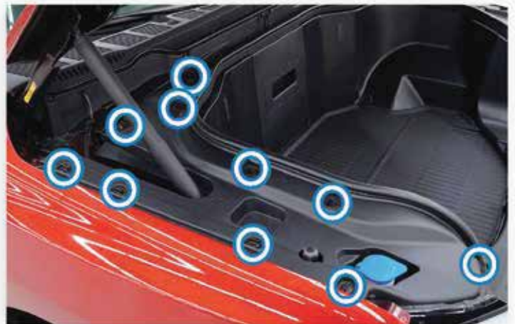
Disengage all 1/4 turn fasteners, turn counterclockwise, remove panel lifting from the rear first.