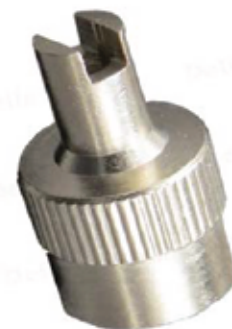
Valve Stem Tool