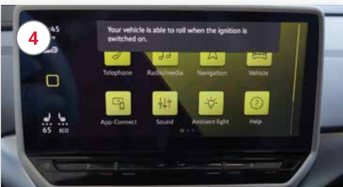
Infotainment screen will indicate vehicle is now able to roll.