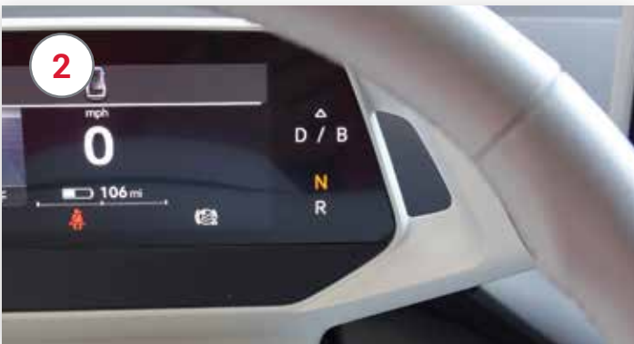
The dash cluster will indicate Neutral (N) .