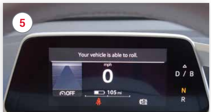
Instrument cluster will also indicate vehicle is now able to roll.