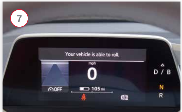
Instrument cluster will also indicate vehicle is now able to roll.

To turn off roll function, place vehicle back in park by pressing the park button on the shifter.