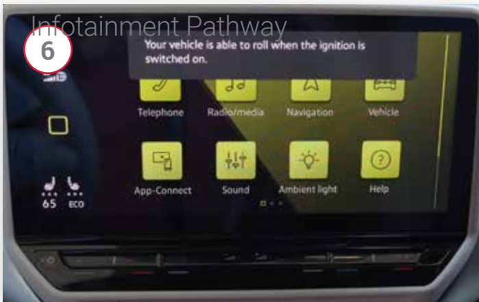
Infotainment screen will indicate vehicle is now able to roll.