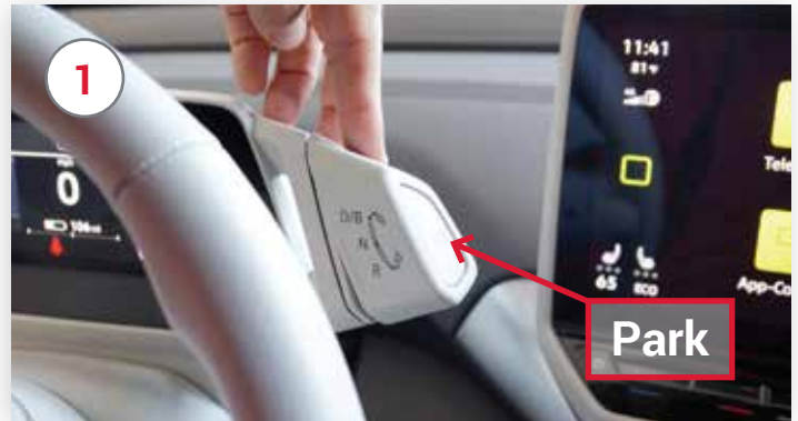
Enter the vehicle with key fob and depress foot brake. Shift vehicle to neutral by pulling the top of the shifter one click towards you.

Prior to deactivating anti-roll, make all connections to tow vehicle to prevent roll away