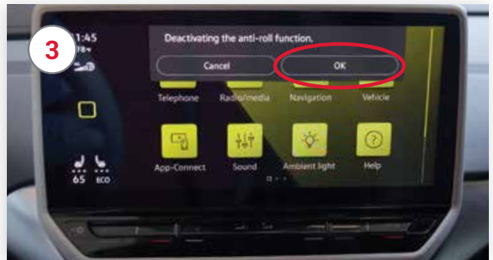
Infotainment screen will prompt you to deactivate anti-roll. Select OK .