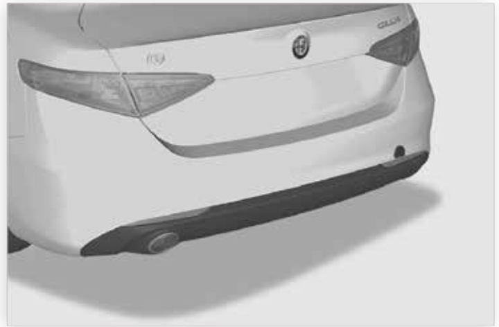
Rear Tow Eye Cap Location