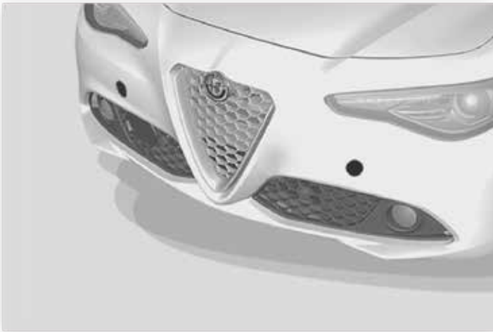
Front Tow Eye Cap Locations