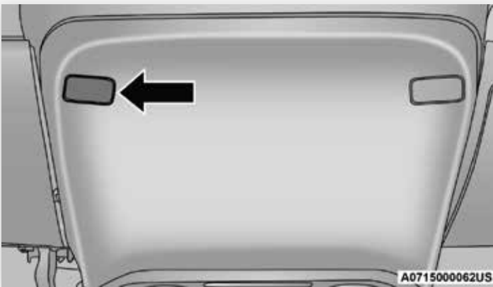
Gear Selector Release Cover