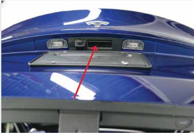
Exterior Rear Trunk Switch