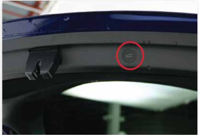
Interior Trunk Close Switch powered rear trunk