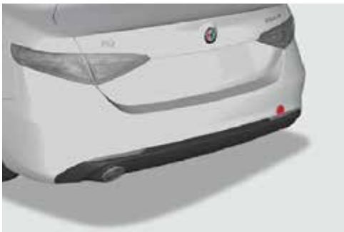
Rear Tow Eye Cap Location