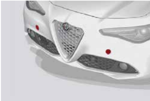
Front Tow Eye Cap Locations