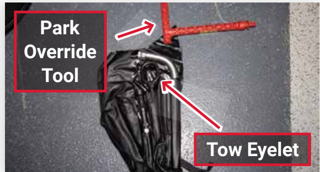
Tool Kit and Park Override Tool