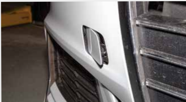
On the front bumper, press the left side of the front eyelet cover to remove.