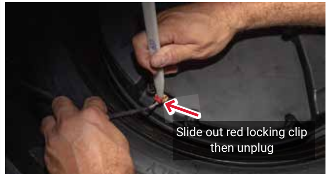
Unplug the subwoofer, and spin off the retainer nut to remove.