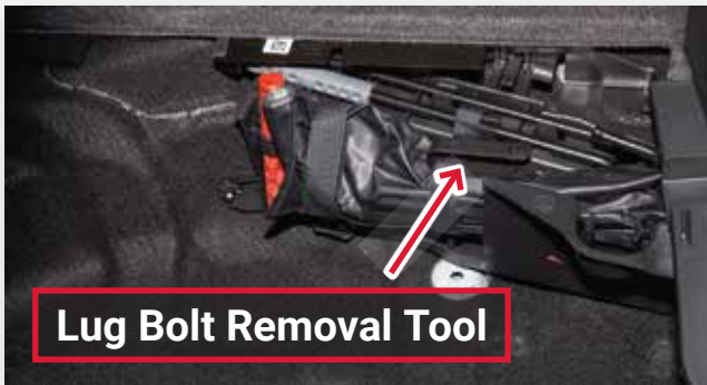
The tool kit is retained with a velcro strap.