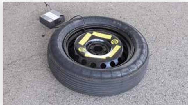
Fill the tire to the recommended tire pressure specification.