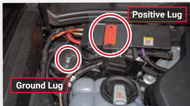
Jump Start procedure