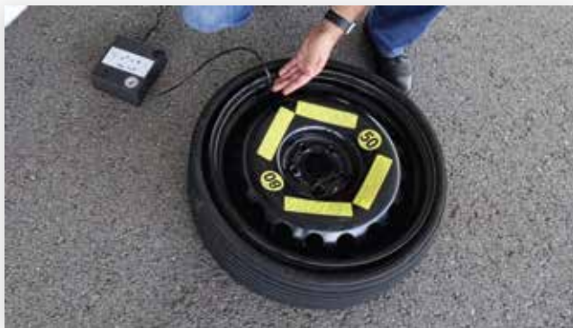
Connect the air line to valve stem. Plug in the compressor to the power point in the cargo area.