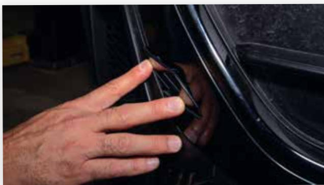
Press the top of the front eyelet cover to remove.