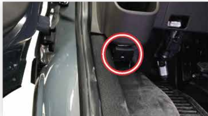
Hood Release is in Driver Side kick panel

In the event the Charge Coupler refuses to disengage from the charge port it will need to be manually released from the vehicle via the mechanical release under the hood, driver side behind core support.