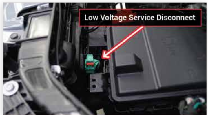
Locate Charge Coupler Release and Low Voltage Service Disconnect